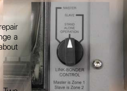
*Link-bonder control switch