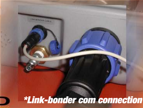
*Link-bonder com connection