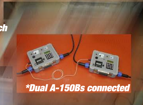
*Dual A-150Bs connected